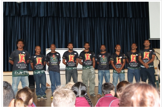
Kokoda Track Porters

Thankyou to those who donated a gold coin towards No Roads Health and Education projects in PNG.